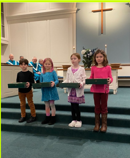
Students Receive Faith Chests, one of the many activities offered at Wapping Community Church