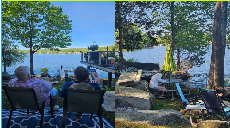
Peaceful shots, above, at the Confirmation Retreat, May 16, in East Hampton.