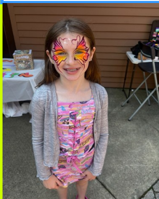
Church Picnic Fun!