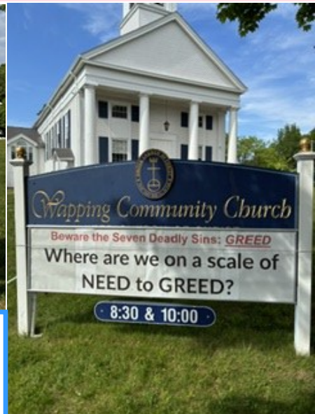
WCC's Latest Series on Our Outdoor Sign: Beware the Seven Deadly Sins