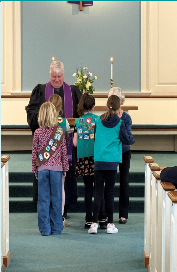
The Girl Scouts Helped with the Service on March 8, Girl Scout Sunday