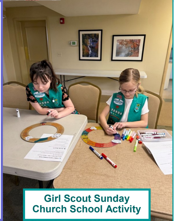
Girl Scout Sunday Church School Activity