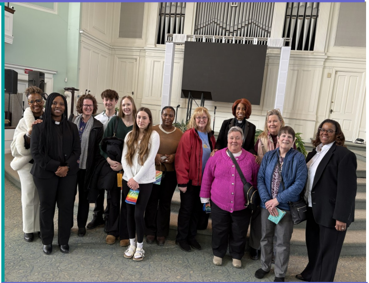
Confirmation Class Attended Liberty Christian Center in Hartford (above)

We were able to supply six twin beds and two queen beds. Participants worked at a "Move-In Day" event where they carried furniture and household items into apartments that Journey Home was setting up. Thanks to everyone who contributions to the purchase of the mattress-