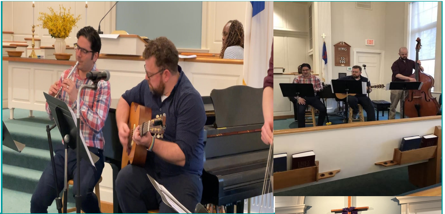
The Jolly Beggars Musical Group Played Beautiful Irish Music on Sunday, March 22