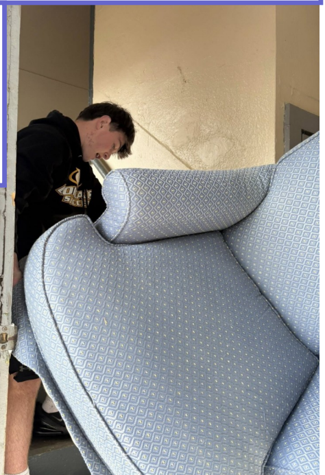
Students Helping with "Move-In Day" in Hartford and East Hartford